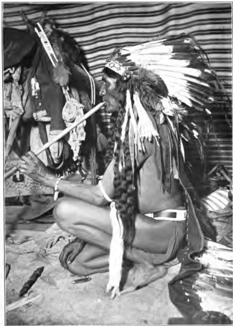
AN UNTAMED INDIAN